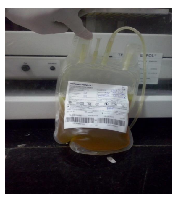
Packed cell Volume