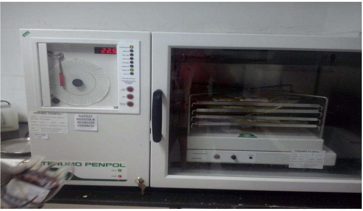
Platelet Agitator & Incubator